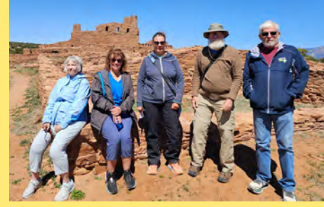
Walking Pueblo ruins at Salinas Pueblo Missions National Monument