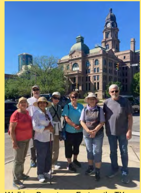
Walking Downtown Fortworth, TX during National Walking Week