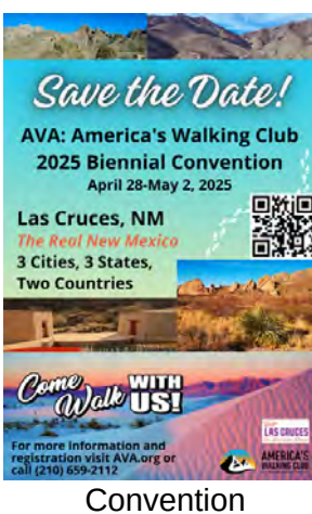
Convention Save the Date